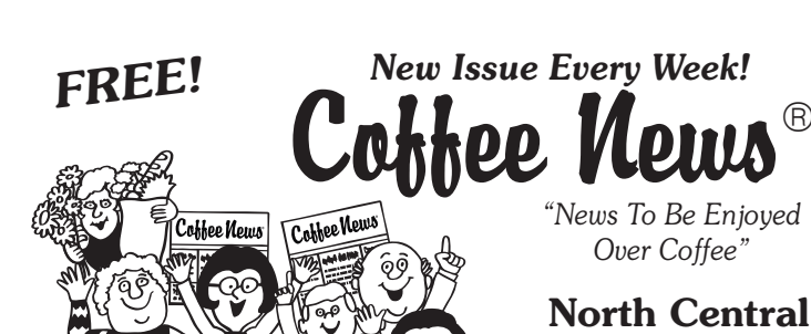
Feel free to take your Coffee News home!

Conveniently located at entrance 48 inside Pearle Vision in West Edmonton Mall