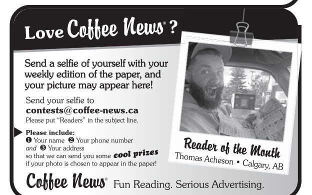
Stay sate! A message from your friends at Coffee News ®