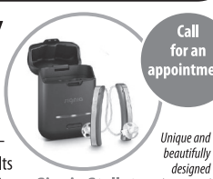
Unique and beautifully designed hearing aid Signia Stylleto

Did you know all seniors and low income adults qualify for $900-$2400 towards hearing aids?