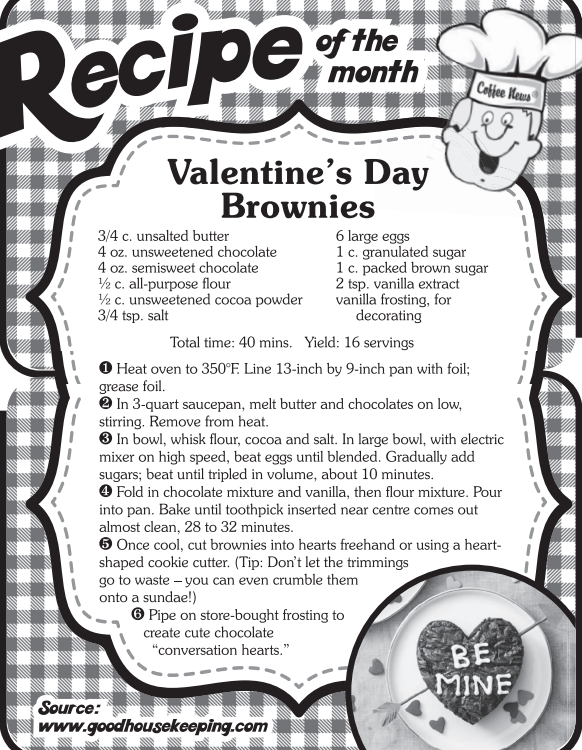
Visit us on Facebook-CoffeeNewsWeekly