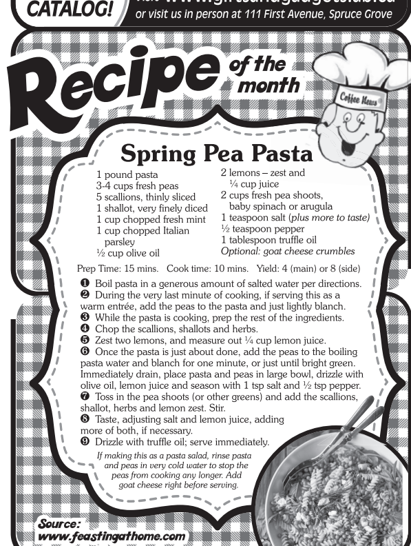
Feel free to take your Coffee News home!