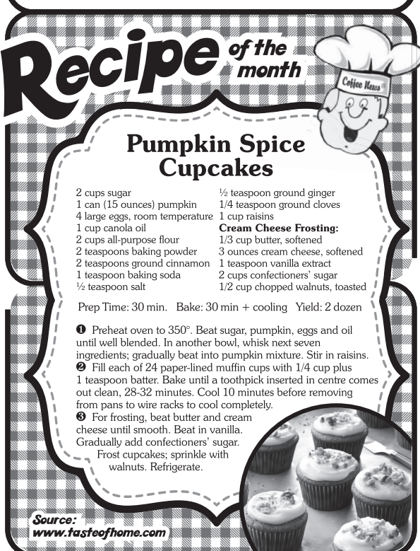
Feel free to take your Coffee News home!