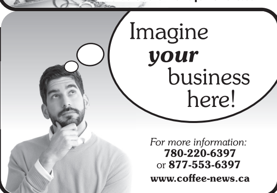
Feel free to take your Coffee News home!