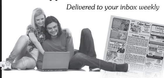
Please visit www.coffeenewswinnipeg for details