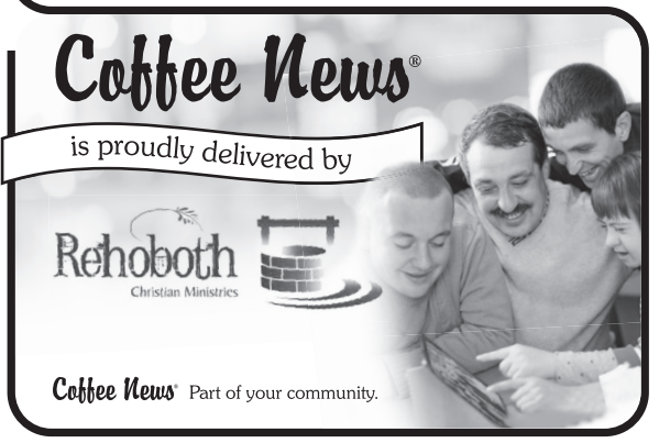
The World's #1 Restaurant Publication!