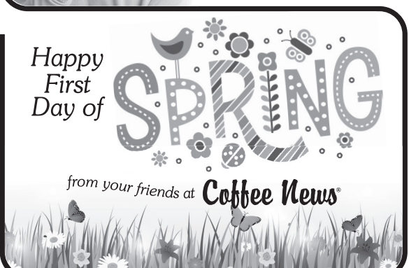
CN-Proudly printed by One to One Mailing