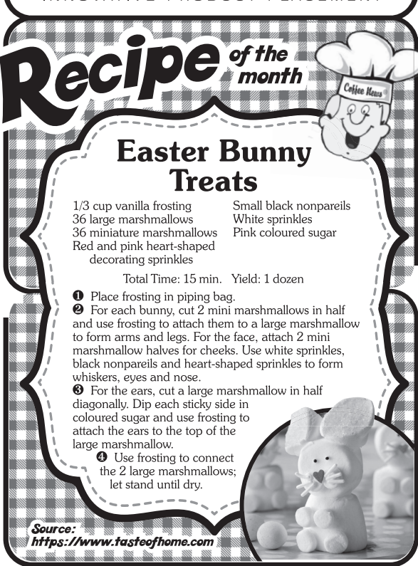
CN-Proudly printed by One to One Mailing