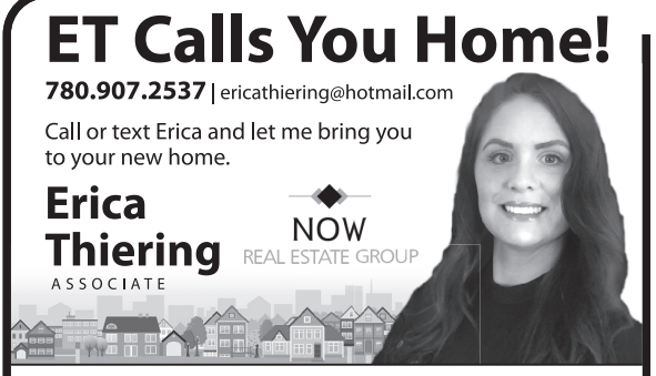
Interest rates are low – now is the time to buy.