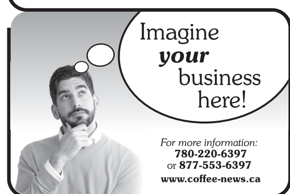
CN-Proudly printed by One to One Mailing

601 - 1A St. S.E. Slave Lake, Alberta Phone: 780.849.5433