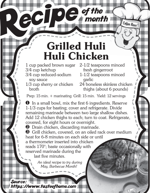
CN-Proudly printed by One to One Mailing