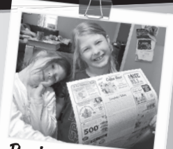
Readers of the Month from Millet, AB

Please include: 1 Your name 2 Your phone number and 3 Your address so that we can send you some cool prizes if your photo is chosen to appear in the paper!