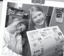
Readers of the Month from Millet, AB

Coffee News Fun Reading. Serious Advertising.