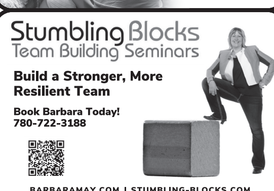
BARBARAMAY.COM | STUMBLING-BLOCKS.COM