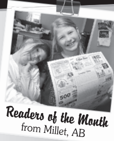
Readers of the Month from Millet, AB

Please include: 1 Your name 2 Your phone number and 3 Your address so that we can send you some cool prizes if your photo is chosen to appear in the paper!