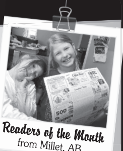
Readers of the Month from Millet, AB

Please include: ① Your name ② Your phone number and ③ Your address so that we can send you some cool prizes if your photo is chosen to appear in the paper!