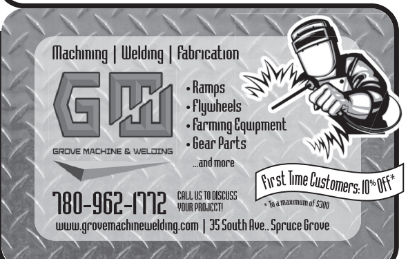
CN-Proudly printed by One to One Mailing