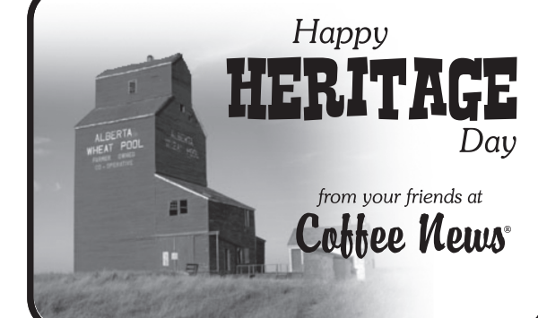
The World's #1 Restaurant Publication!