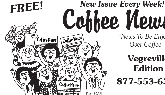
The World's #1 Restaurant Publication!