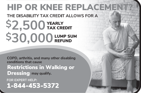
CN-Proudly printed by One to One Mailing