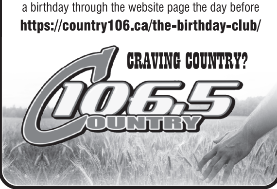
CN-Proudly printed by One to One Mailing