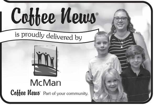
The World's #1 Restaurant Publication!