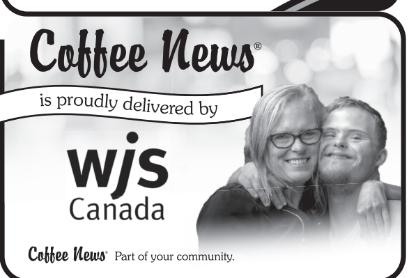
The World's #1 Restaurant Publication!