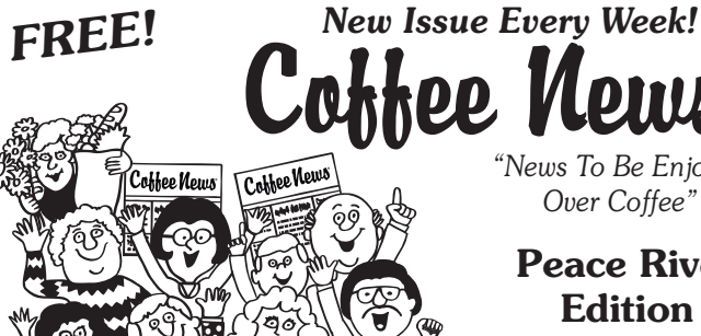
The World's #1 Restaurant Publication!