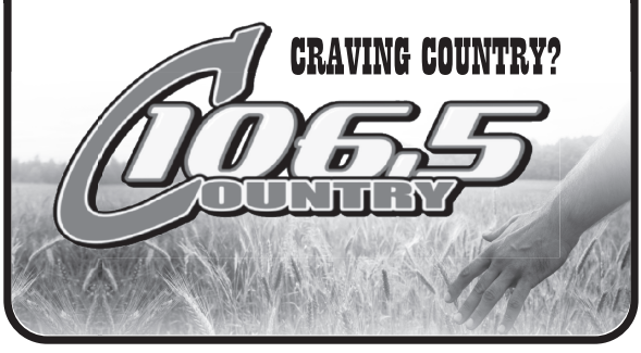
Zone 20 - Vegreville

Call or text 780.632.6671 during the show or submit a birthday through the website page the day before https://country106.ca/the-birthday-club/