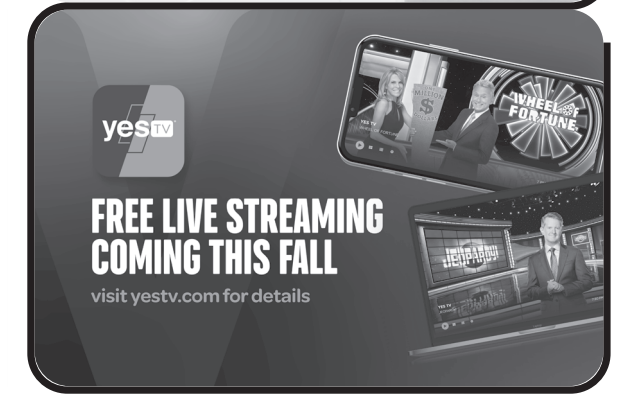
Zone 20 - Vegreville

Call today and receive a FREE SHOWER PACKAGE PLUS $1600 OFF