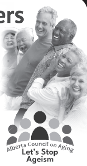
Alberta Council on Aging Let's Stop Ageism

AN INDEPENDENT NON-PROFIT, CHARITABLE ORGANIZATION SINCE 1967