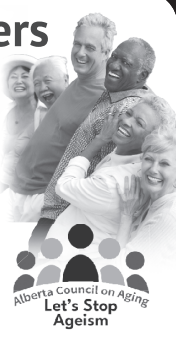
Alberta Council on Aging Let's Stop Ageism

AN INDEPENDENT NON-PROFIT, CHARITABLE ORGANIZATION SINCE 1967