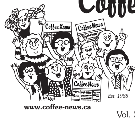
The World's #1 Restaurant Publication!

ALBERTA OWNED AND OPERATED FOR OVER 35 YEARS