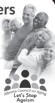
Alberta Council on Aging Let's Stop Ageism

AN INDEPENDENT NON-PROFIT, CHARITABLE ORGANIZATION SINCE 1967