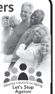
Alberta Council on Aging Let's Stop Ageism

AN INDEPENDENT NON-PROFIT, CHARITABLE ORGANIZATION SINCE 1967